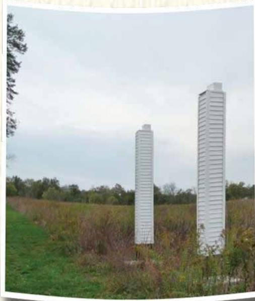
Chimney Shift Towers constructed by Eagle Scout Bill Ristow can be seen on a visit to Wapihani Nature Preserve.

Eagle Scout Bill Ristow decided to take action and create critical habitat for the birds before it was too late. Bill made a plan to construct bird houses at the Wapihani Nature Preserve in Fishers—no small feat as these are no ordinary bird houses, they are 12 feet tall!